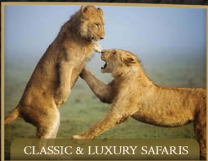
CLASSIC & LUXURY SAFARIS